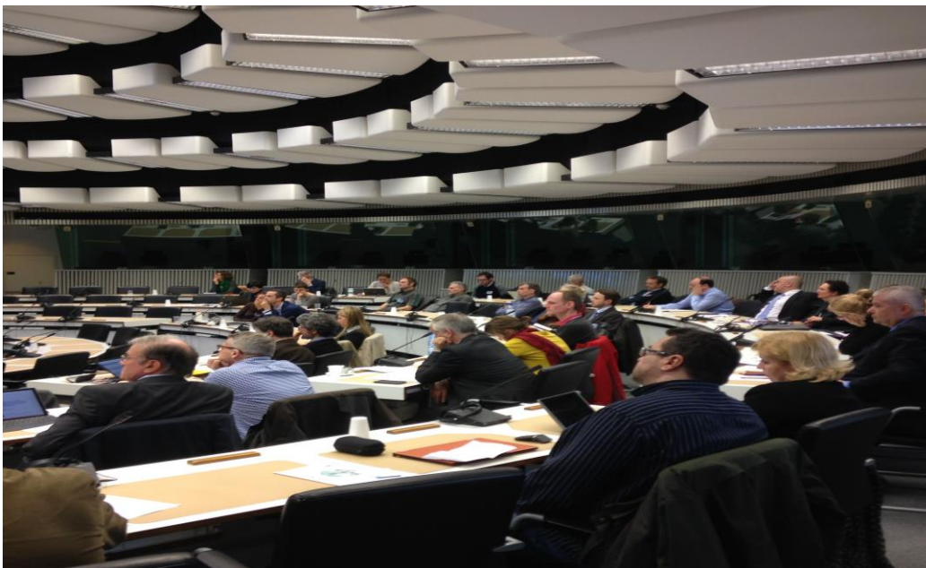
Photo: An international and experienced audience attended the conference