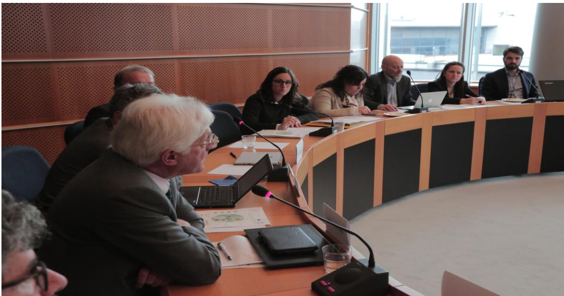
Photo: The debate hosted by the European Parliament with the MP Eleonora Evi from the ENVI Commission